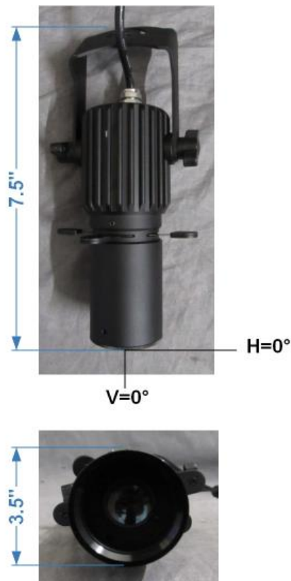
FIG. 1 LUMINAIRE